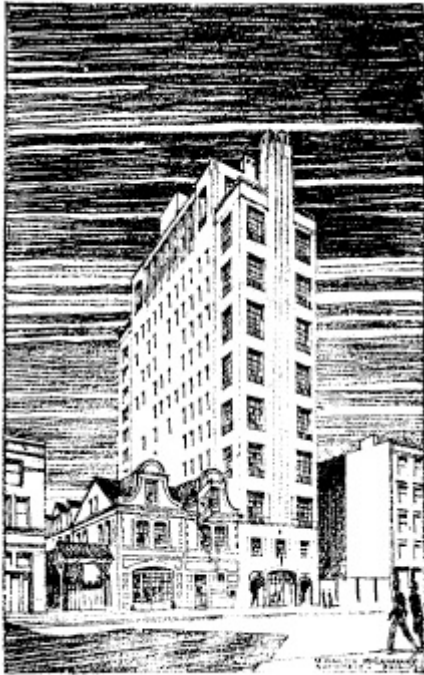
THE FOUNDRY, HOBOKEN